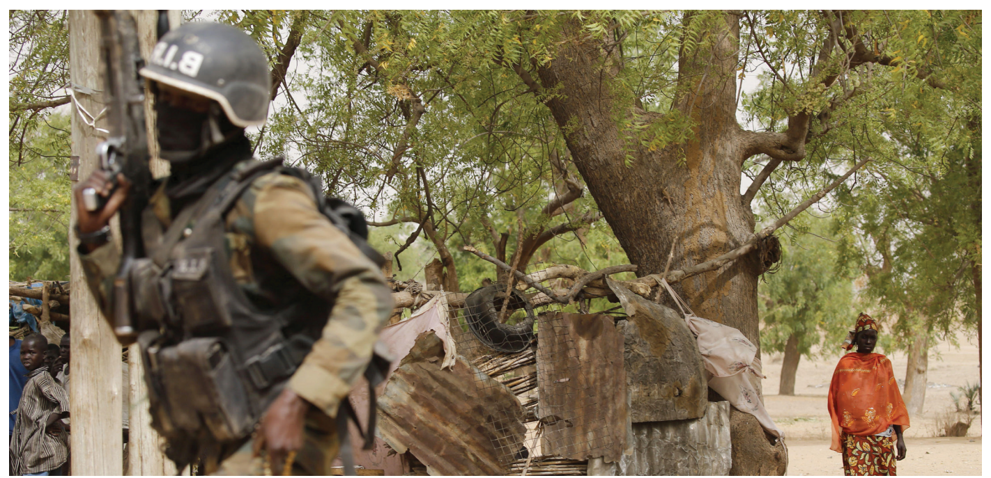
The Anglophone crisis has had a disproportionate impact on women and girls, who face high levels of structural, physical, and sexual violence.