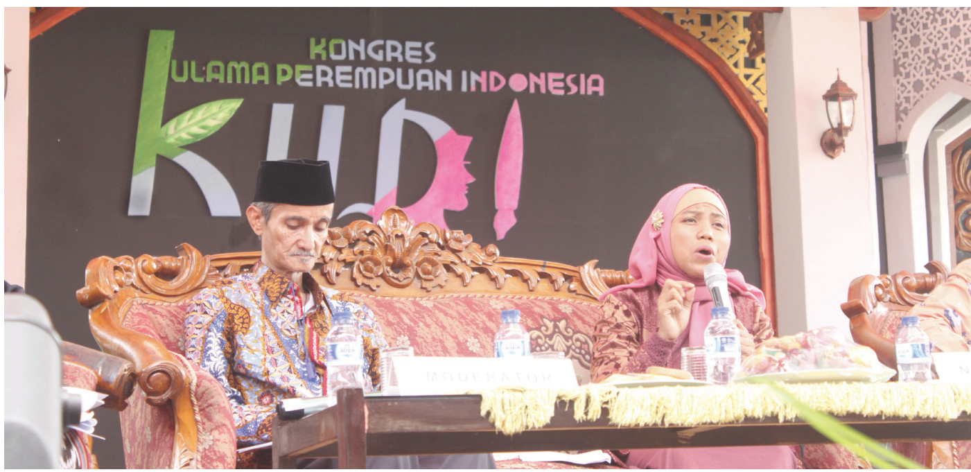
KUPI gathers women ulama from diverse institutions and organizations to advocate for gender justice and social justice.

"In Indonesia, the conservative and radical groups tend to dominate Islamic teaching. They also dominate women's issues—early marriage, niqab, polygamy and the definition of a wife's obligations. Gender bias and discrimination of women are also shaped by a strong influence of the media, particularly social media and technology. However, women ulama offer an Islamic perspective that promotes gender equality and women empowerment, and their teachings are well-documented." <sup>30</sup>