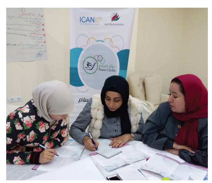
"Peace Circles" serve as a mechanism for coordinating peacebuilders to jointly advocate for women's participation in politics and peacebuilding.

To disseminate the knowledge and learnings from the IPT, LWF carried out awareness-raising sessions targeting primarily activists, teachers, civil servants, housewives and female spiritual guides (Morsheda).52 The aim was to encourage local organizations to develop and implement their own peacebuilding activities that would challenge extremist discourse and promote social cohesion in their communities. To reach larger segments of the population, LWF initiated a media campaign that prompted public discussions on the ongoing conflict in Libya and its effects on communities, as well as on the role of women (including challenges they face) in local mediation efforts and in promoting peace. The campaign was rolled out on national television programs, local radio shows, and in newspaper articles featuring interviews with public figures, activists, politicians, journalists, and working professionals on their perspectives and reflections on the peacebuilding efforts. Bringing the discussion into