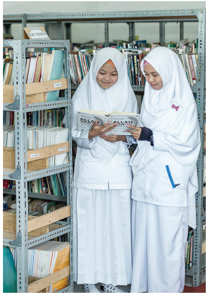
The decentralized tradition of Islamic education emerged as an alternative educational institution accessible to the vast majority of the population – including women.

Even with this strong national identity and a secular constitution, religion has often been a lightning rod for tensions in Indonesian society. Suharto's three-decade dictatorship used religious rationales to instigate and justify the violent anti-communism campaign that led to the killing of more than a million people.<sup>5</sup> After the Suharto regime fell in 1998, restrictions on establishing Islamist organizations were removed. Radical Indonesian Muslim activists were released from prison or returned from exile abroad.6 Through their dominance of media, Islamist groups crowded the Indonesian public sphere. The Islamic State and its Indonesian affiliates have used sophisticated communication networks to recruit Indonesian Muslims, including women and children, to travel to Syria and Iraq.<sup>7</sup> In the third largest democracy in the world, this has given conservative Islamists the clear lead in the marketplace of ideas—until very recently.