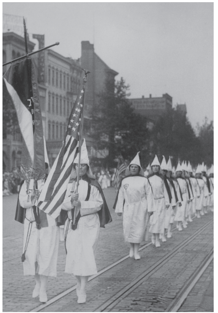
White women have historically played an integral part in white supremacy in the United States.

White supremacist violence also intersects with antisemitism, anti-immigration beliefs, and male supremacy. Periods of increased white supremacist-motivated violence ebb and flow cyclically. The United States is currently experiencing an intensifying period of white supremacist violence. This violence is spread across all age demographics, from teenagers to baby boomers, and spans all economic demographics. However, those under 25 are overrepresented in online-driven, accelerationist, neo-Nazi affiliated groups. Militia and separatist groups tend to attract 25- to 50-year-olds, and adherents to conspiracy-driven affiliations such as QAnon tend to be heavily populated by those 35 and over.