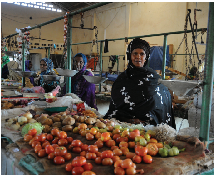
With the increase in women-headed households in Somalia due to ongoing conflict, and the limited economic opportunities for women, some become suuqley or "market women.

In the 1980s Islamic study groups and Muslim Brotherhood cells appeared throughout Somalia.<sup>5</sup> One contributing