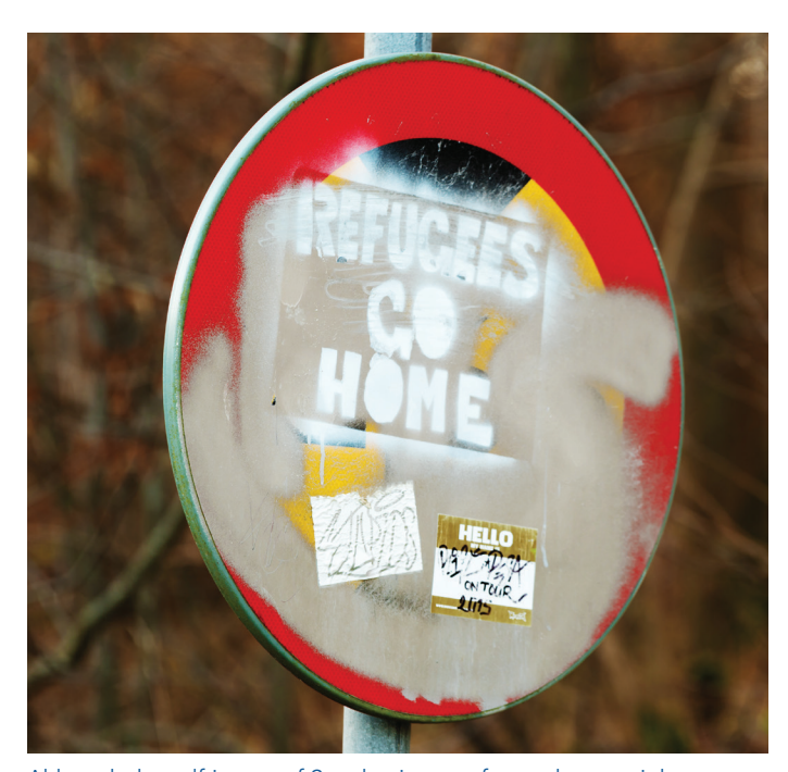
Although the self-image of Sweden is one of a pro-human rights, open, and tolerant country, racial segregation and discrimination persist.

The white extremist, or white supremacist movement has a long history of spreading its ideology and committing acts of extremist violence in Sweden. Unlike many other European countries, Sweden did not ban fascist organizations after World War II, and the country had no mechanism for accountability to prosecute those who collaborated with the Nazi regime. Nazi-aligned organizations continued their activities. In the 1980s, an influx of refugees from Lebanon inspired a surge in xenophobic sentiment among Swedish youth, who questioned why Sweden should receive immigrants when young people were lacking housing and employment. 3 In the 1990s and 2000s, "White Power" and "Viking Rock" groups reached new audiences of young people. 4 Several new white supremacist groups were established, such as the White Aryan Resistance ("Vitt Ariskt Motstånd" or "VAM"), which carried out repeated acts of terrorism and racial violence, burglaries, bank robberies, police murders and car bombings of perceived opponents.