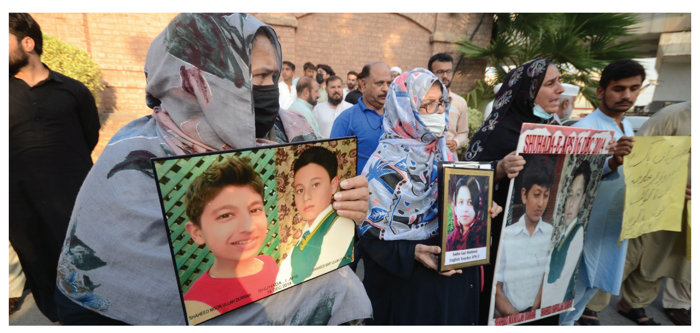
In the past two years, Pakistan has seen a resurgence of the Tehreek-e-Taliban Pakistan (TTP), a militant extremist organization notorious for its brutal attacks on civilians.

or madrassas. Zia-ul-Haq's 1979 education policy offered new economic incentives for opening madrassas, leading to the formation of over 2,000 of them. During the Afghanistan war, madrassas trained terrorist leaders and ideologues, as well as foot soldiers who responded to the call for jihad.8 They also provided food and clothing, often attracting poorer students, and functioning as orphanages for children who lost their parents to war. Today, radical madrassas are often supported by foreign donations, such as funding from Islamic philanthropists, religious-political parties, sectarian militant organizations, and charities based in Saudi Arabia and Sunni Arab Gulf states.9 Higher government institutions have limited oversight over madrassas and their activities, allowing extremist perspectives that promote hate speech, sectarianism, and militarism to be integrated in curricula unnoticed.<sup>10</sup>