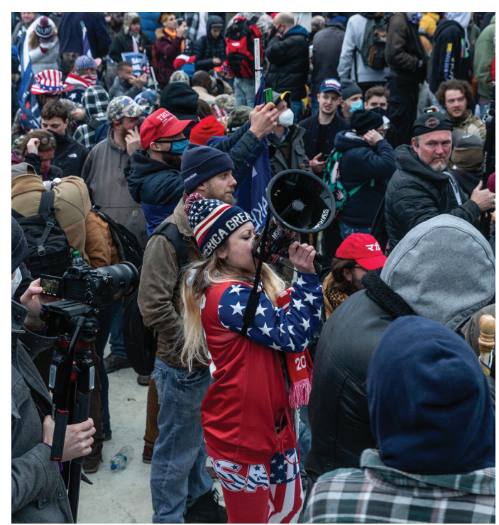
Women often functionally work towards amplifying, marketing, and mainstreaming the messaging of white supremacist ideology.

Abused people often become abusers. Research shows that the highest indicator that someone will act out violently is a history of experiencing violence to effectively solve problems earlier in life, as a victim, witness, or perpetrator. 11 Most mass shooters have a history of violence