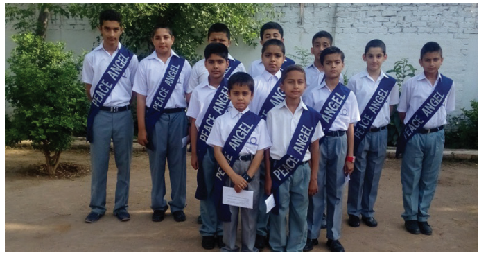
The peace curriculum builds capacity for critical thinking and reasoning among students and illustrates a positive alternative to masculine concepts of duty and honor.

International counterterrorism (CT) and countering violent extremism (CVE) interventions focused on early warning signs have, in some cases, asked local actors to collect and report information on fellow community members or family members to prevent their participation in violent extremist groups. Such interventions have been subject to growing criticism, particularly regarding their engagement of women in securitized roles and as intelligence-gatherers.<sup>56</sup> As a backlash to this approach, critics have characterized womenled civil society's engagement with violent extremism as topdown and "instrumentalized" by the global CT and CVE agenda.<sup>57</sup> Hyder's approach to early warning signs, however, is much different: through her knowledge of the local context she operates in, she has established trusted relationships with students, teachers, and parents, who approach her with their concerns. She can then engage them in ways that introduce and harness positive approaches to extremism, rooted in culture and religious traditions. Her approach prioritizes the creation of networks of parents and students, equipped