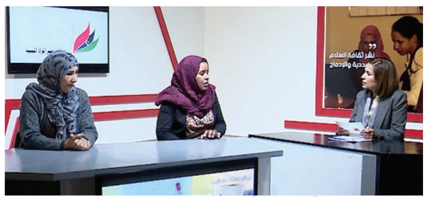
LWF initiated a media campaign that prompted public discussions on the ongoing conflict in Libya and its effects on communities and on the role of women in promoting peace.

(UNSCR) 1325, using the Women, Peace and Security (WPS) framework to advocate for women's political participation. UNSCR 1325 reaffirms women's contributions and role in preventing and resolving peace conflicts. negotiations, peacebuilding, peacekeeping, humanitarian response and in postconflict reconstruction. It stresses the importance of women's full and equal participation in all efforts to maintain and promote peace and security. However, in framing work on women's participation in the context of UNSCR 1325, LWF was confronted with resistance and skepticism among parts of their target audience. For many Libyans, advocating for the presence of women in the political sphere purely through a UN framework was experienced as foreign and regarded as an extension of a Western agenda.46