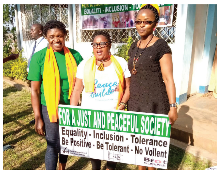
The narratives of women-led networks prioritize human security and welfare and center respect for the human being.

Members of both networks leverage their gender identity to collectively advocate for peace. Their knowledge of and proximity to local communities is essential for navigating the complex dynamics and spaces of the Anglophone crisis. Through skilled communication and trust-building, the SWNOT negotiated with separatist groups and government forces to enter active conflict zones in order to provide medical and psychosocial support, dignity kits, and wash items to internally displaced persons.38 Since women and their perspectives are largely excluded from the conflict, it was easier for SWNOT members to be perceived as neutral actors. Following the killing of Confort Tumassang in August 2020, and the Kumba school massacre in October 2020, SWNOT initiated a civil societyled women's protest in Kumba.<sup>39</sup> While they expected 300 women, over 3,500 came out and peacefully protested. After the protest, Anglophone diaspora activists began calling from the United States, telling armed leaders to be careful since the presence of Anglophone women protestors showed their struggle had failed.40 Since the protest and the diaspora response, killings of women have come to a halt, a lockdown was cut short, and separatist fighters have ceased actively targeting and using violence against women. These incidents reinforce the power of women's peace networks to transform extremisms and disrupt radicalization to violence by strategically deploying their gender identity.