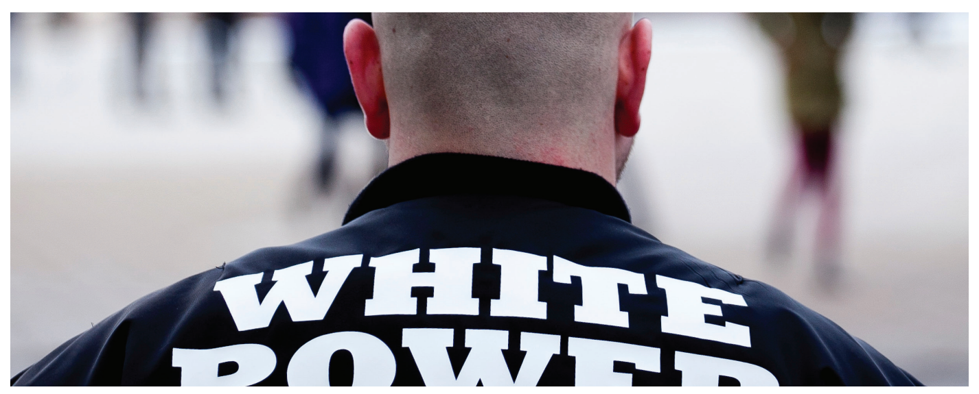
In Sweden, white extremist groups groups promote a specific image of maleness: a large, muscular, warrior archetype.

Currently, the staff is a mixture of social workers, academics and former white supremacists. EXIT's model has been adopted by other countries such as Norway, Germany, Sweden, Denmark and the United States to disengage right-wing extremists and gang members, and the program has been expanded to support de-radicalization of Islamic extremists. Available data indicates EXIT Sweden has a high success rate in addressing deradicalization and disengagement for its target population, although the data is limited due to Sweden's personal data protection laws.<sup>32</sup>