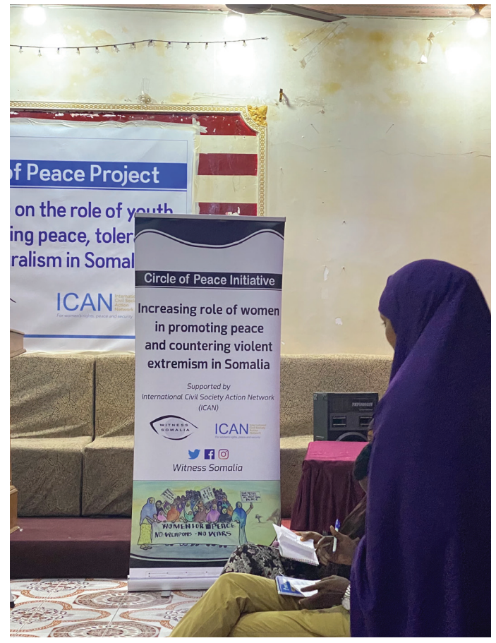
Witness Somalia selects women to form small groups called "Circles of Peace" where they can discuss their role in preventing extremism and promoting peace and security

In addition, because the suuqley move freely through local communities, they are well positioned to engage government and armed actors and gather intelligence that they share with Al-Shabaab. One government interviewee posited that as much as 85% of Al-Shabaab's intelligence was gathered by women.<sup>30</sup> Recognizing this role, Al-Shabaab has a practice of "wife inheritance", remarrying widows in order to keep the intelligence within the group.<sup>31</sup> As a result of gender norms, most men and community leaders would not suspect a woman gathering information and speaking with other community members. Their traditional gender roles also facilitate the logistics of Al-Shabaab. For instance, women may use their homes to hide members of Al-Shabaab and convene them for strategic planning.32 In addition, Islamic dress can facilitate the transport of weapons and movement through security checkpoints