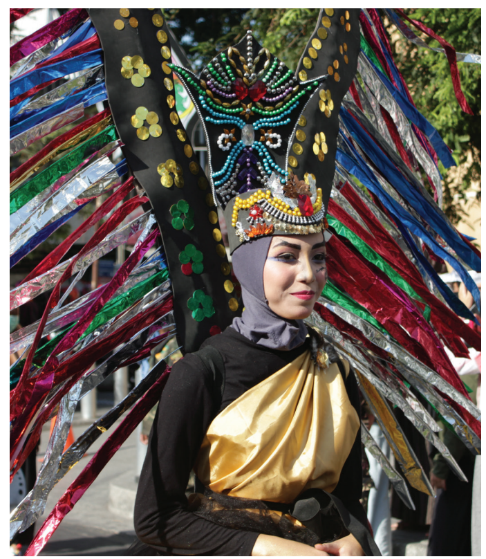
In Indonesia, the social authority of women ulama is recognized by the population because they are embedded in society through the

Conservative social media posts might display quotes from the Qur'an presented in a visually appealing way but lacking in context, highlighting passages that align with specific ideological objectives.<sup>27</sup> Narratives emphasize the importance of traditional gender roles in maintaining balance and complementarity, and reject gender equality as an imported Western concept.<sup>28</sup> The end goal of hijra is portrayed as the attainment of pious love, happiness and tranquility – attractive prospects for young Indonesian women in search of an identity. By using their graphic design skills, knowledge of social media and connection to