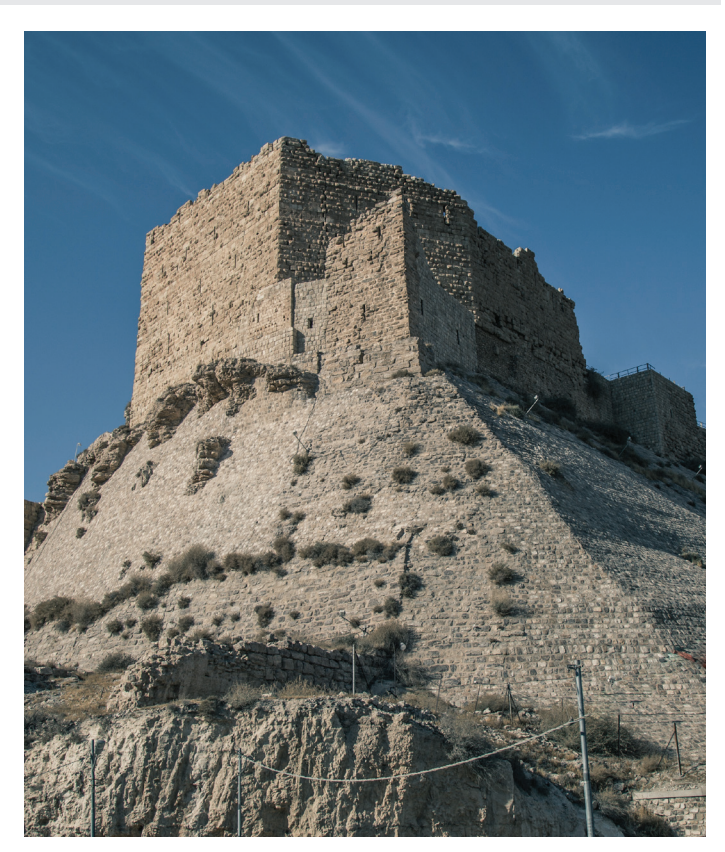
During the 2016 Kerak castle attack, suspects escaped police by taking advantage of conservative cultural norms.

The Jordanian government has responded to these incidents by building up its police and military presence with the support and funding of international partners, most predominantly the United States.<sup>6</sup> Under its 2006 anti-terrorism law, Jordan also instated the death penalty for terrorist crimes, a move widely criticized by human rights organizations.7 There is evidence that the government's attempts at reinforced border defenses and improved surveillance capabilities have successfully thwarted terrorist attacks.8 However, internal structural