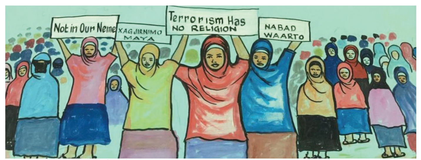
Witness Somalia recognizes art as a form of expression and understands the role of artists in raising public awareness around complex issues and seeking creative solutions.

Witness Somalia understands religious leaders' crucial role as interpreters of Islamic texts and traditions. One influential religious leader participated in the radio program to discuss the rise of Wahhabi ideology in Somalia from the 1970s and 80s, which fueled the establishment of radical extremist groups. This program raised awareness about the psychosocial impact of violent extremism and introduced civil society voices with alternative perspectives, such as the ways in which Islam promotes the values of peace and tolerance.