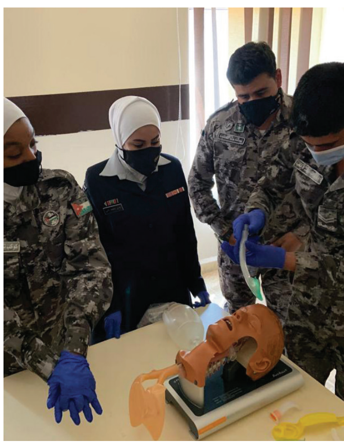
Trust-building strategies have led to successes in the HASBANI project, like the acceptance of mixed gender trainings.

Finally, the HASBANI project, while taking strides towards removing technical and cultural barriers to increasing the proportion of women in frontline roles, does not place as much attention on considering the