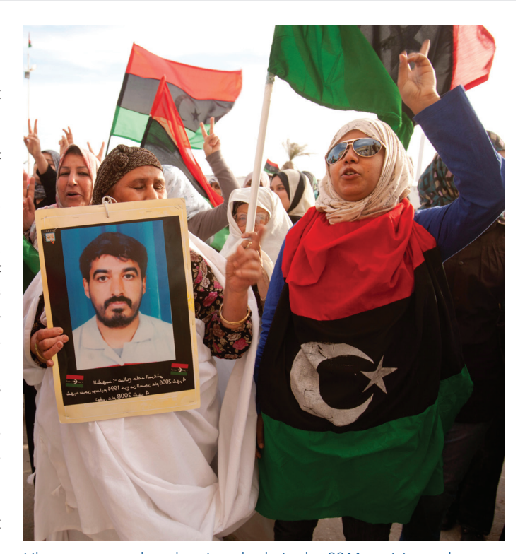
Libyan women played a pivotal role in the 2011 uprising - also referred to as the February 17 revolution - yet their voices were rapidly silenced in its aftermath.

Since the 2011 uprising that removed then President Muammar Gaddafi from power, Libya has been characterized by widespread political instability and violent internal conflict exacerbated by the presence of transnational terrorist groups, mercenaries, and criminal organizations. Following the 2020 ceasefire, a failure to hold presidential and parliamentary elections in December 2021 has, once again, left the country to be ruled by two rival administrations and sparked fear of renewed violence and a resurgence of extremist groups.3 Although the Islamic State was ousted from Libya militarily and politically in 2019, the factors that facilitated its rise widespread political fragmentation, structural inequalities, and interference by international actors – persist.<sup>4</sup> Various militant groups including militias allied to the Muslim Brotherhood, Salafi militias, and jihadists aligned with Al-Qaeda and the Islamic State maintain control over parts of Libyan territory and influence its governing actors. These groups leverage the country's protracted insecurity, poor governance, and factionalism to spread extremist narratives that foster division across political and tribal lines in order to consolidate their influence and recruit mostly young men to their ranks.<sup>5</sup>