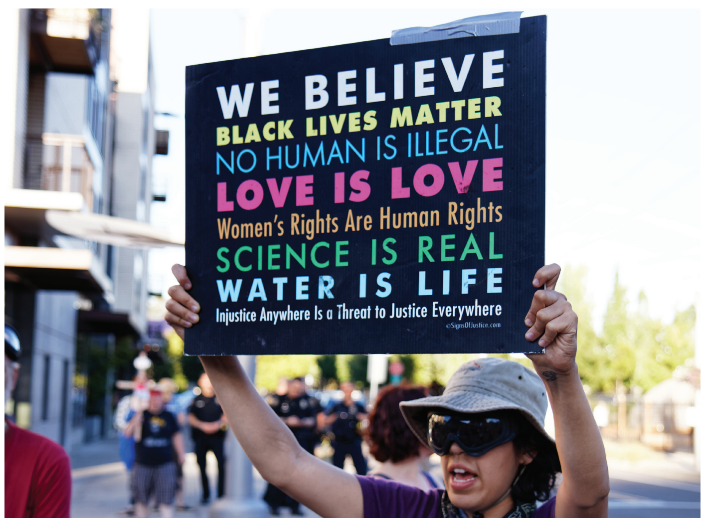
Encouraging engagement in pluralistic philosophical and political discourse can help people have a wider view and greater empathy for the struggles of many communities.