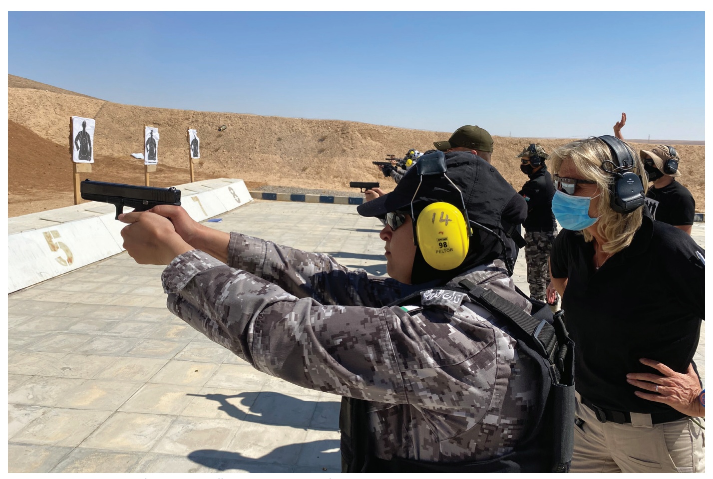
The HASBANI project trains female police officers to prepare them for operational roles within the Jordanian Public Security Directorate (PSD).

present, female officers should be present. In the tactical medic courses, trainers rectify misconceptions and assumptions around male-on-female medical support, such as that men can be charged with assault if they give CPR to an unconscious woman.<sup>28</sup> Through these technical trainings, the project aims to improve the PSD's capacity to deal with female suspects, victims, and civilians in CT operations.