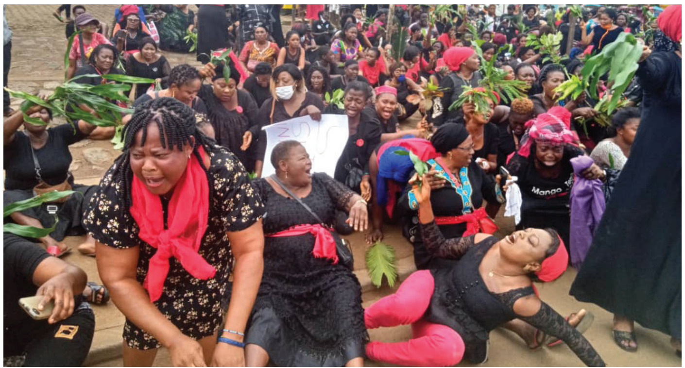
Women at a protest in Kumba participate in a public lamentation to following the killing of seven children at a school in October 2022. Lamentations are cultural practices during which women publicly wail to condemn ongoing violence.